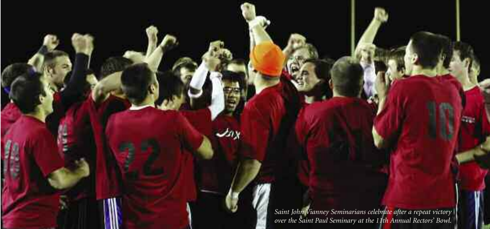
Saint John Vianney Seminarians celebrate after a repeat victory over the Saint Paul Seminary at the 11th Annual Rectors' Bowl.

Men in Christ. Men of the Church. Men for Others.